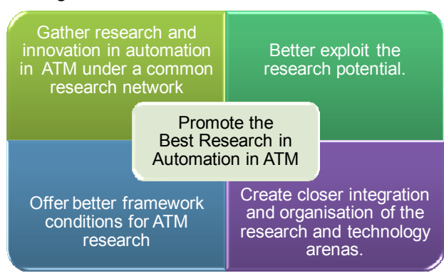
Figure 1. HALA! Organizations Distribution

efficiently translated into effective tools. Finally the HALA! participants have a long proven experience on collaborating in complex projects and provide HALA! with the necessary skills and experience to achieve the challenge of automation.